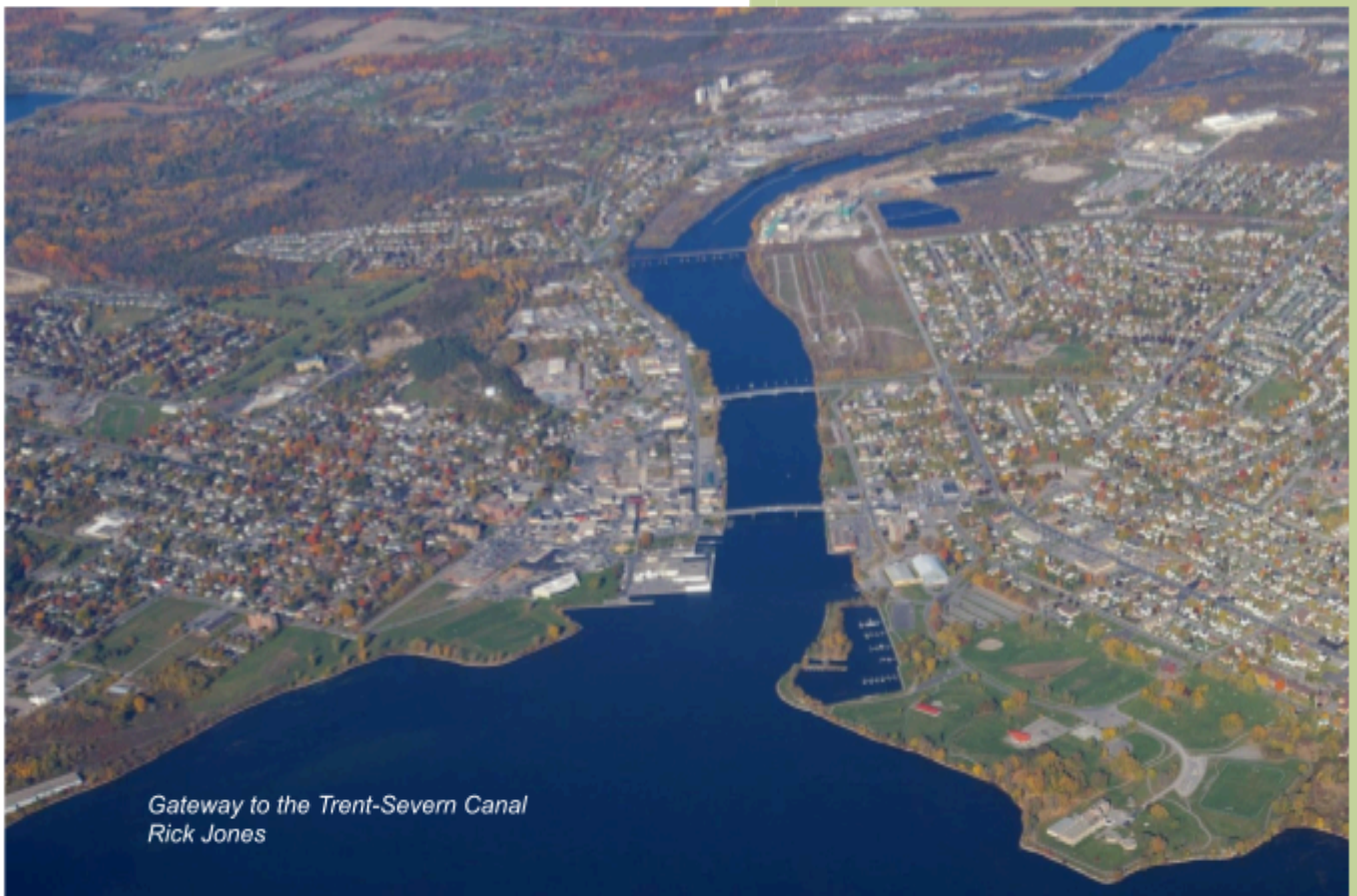
Gateway to the Trent-Severn Canal

Date of Passing: July 21, 2014 Consolidated to By-law #24-010 (January 10, 2024)